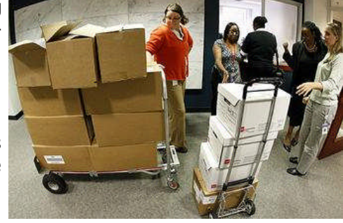
According to the Company's fil- Commission staff receives the filing

ing they are seeking an annual Atlanta Gas Light rate case increase of $54.1 million in